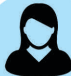
Female Staff on Every Bus