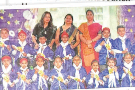
School students on graduation day.