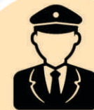
Trained Security Guard