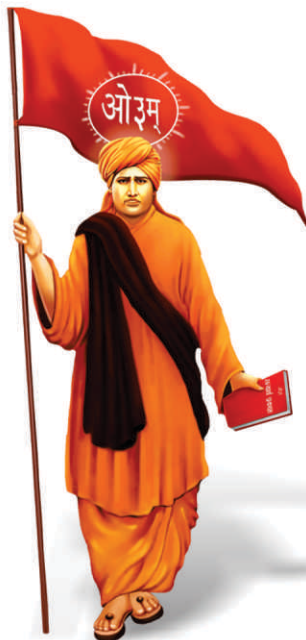
Maharishi Swami Dayanand Saraswati