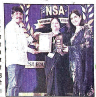
बी.सी.एम. स्कूल ललतों कलं के अध्यापक पुरस्कार लेते हुए।