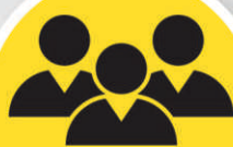
Background Check on Every Staff