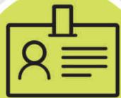
Parent RFID Card